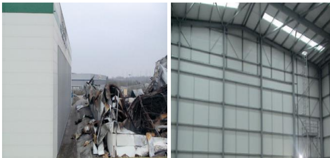
Photographs 3 & 4 show the undamaged adjacent building (exterior and interior respectively)