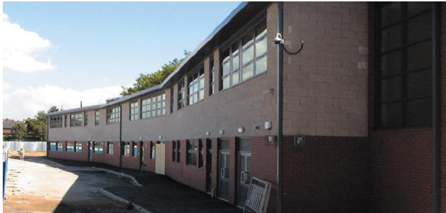
Photograph 1 shows the main school building

At the time of the fire, the construction of Clifton Comprehensive School in Rotherham had just been completed. A significant quantity of equipment (computers and laboratory equipment, etc.) had been installed, but the building was not yet in use by the school. The roof of the building was constructed of PIR insulated roof panels.