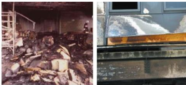
Photograph 2 shows where the flame damaged outer skin of the bottom panel has been lifted to inspect the slight charring of PIR core beneath

The fire service found light smoke but no fire spread on the upper floors of the building. They also reported that although the joint between the floor and first floor walls had not been fire stopped there was no fire spread within the PIR core material.