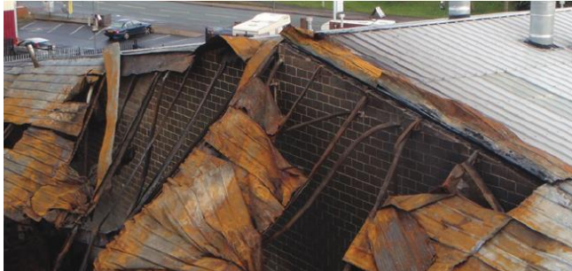
Photograph 1 shows the aftermath of the fire and the performance of the compartment wall

A fire occurred at R A Wood Adhesives completely destroying the part of the building occupied by that business in Staffordshire. The R A Wood Adhesives' facility was adjacent to another business where the two occupancies were separated by a compartment wall. The roof across both occupancies was constructed using PIR core panels.