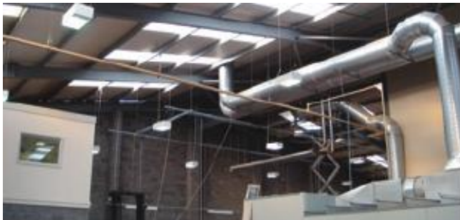
Photograph 2 shows the interior of the adjacent business to be unaffected by the fire

The aftermath of the fire demonstrated that the fire compartment wall performed its intended function in preventing fire spread to the business next door, which was able to continue trading. In this case, the PIR cored insulated panel insulation had been continuous over the top of the compartment wall.