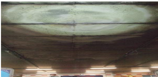
Photograph 2 shows the flame impact on the soffit lining

The overall footprint area of the building is approximately 11,500m 2 with the ground level undercroft car park occupying a slightly smaller footprint of approximately 11,200m 2 . The majority of the car park possesses a flat soffit at 3.14m above floor level that has been created by the installation of 125mm thick PIR cored sandwich panels.