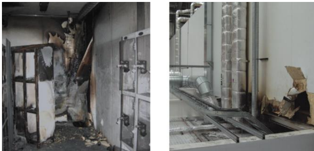
Photographs 2 & 3 show the cut-open wall panels indicating no fire propagation

The room construction comprised of a timber floor incorporating ply-web engineered joists supported off a steel frame. The walls consisted PIR core panels. The ceiling above the room was of timber joist construction which was under-drawn with two layers of fire resisting plasterboard.