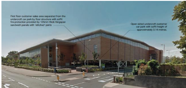
Photograph 1 shows the front elevation of the building from the main road and the corner of the building that was closest to the fire location

An engine bay fire in a parked car occurred in a large ground level undercroft car park below the first floor retail level of a large supermarket.