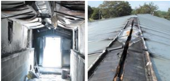
Photographs 2 & 3 show the area where the fire started, and the apex of the roof respectively) (with some discolouration in the area subject to direct flame attack, but no evidence of fire spread)

The fire started in an enclosed passageway linking two open air plant areas on the roof. There was scaffolding at the rear of the premises which gave access to the roof and the fire was thought to have been caused by the accidental or malicious ignition of roof sealant.