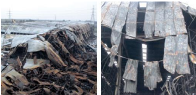
Photographs 1 & 2 show the collapsed south-end of the building and roof-sheeting hanging from severely damaged steelwork

Despite the duration and severity of the fire, significant areas of insulated cladding panels remained with only limited damage to core material indicating that the PIR core material did not promote fire spread.