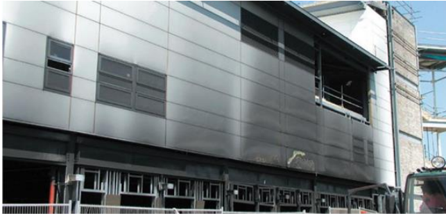
Photograph 1 shows the fire area

It was thought that the fire was started deliberately by adhesive being poured over slabs of insulating material which were stored on the ground floor.