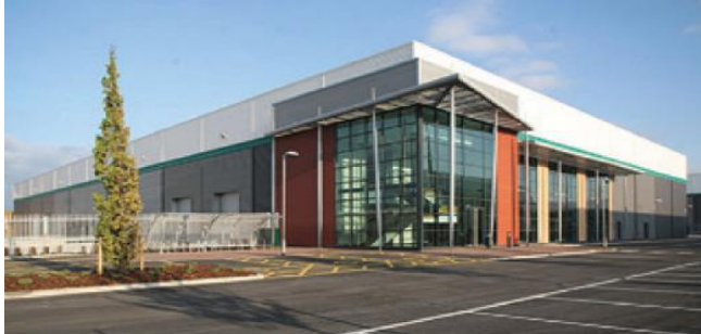
Photograph 1 shows the undamaged exterior of the building

The building provides in-flight food preparation facilities for airline operating from Heathrow.